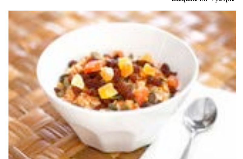
Yields 6 servings adequate for 4 people

Notes: *Cream of Rice cereal can be substituted.